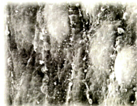
SEM of the internal surface of the carotid (human) artery. This samdried (critical point dried) sample shows not only surface membrane details but also endothelial cell boundaries and their nuclei.